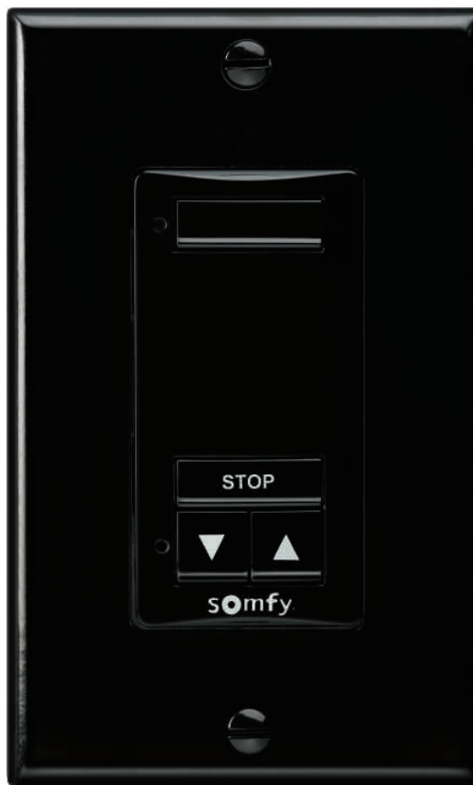
ACTUAL SIZE Part #1810899 (BLACK)