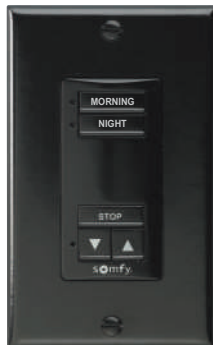
2 Channel Button DecoFlex WireFree™ RTS (BLACK)