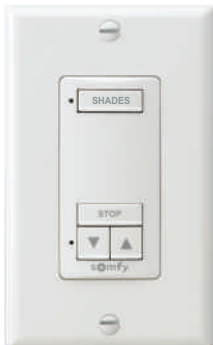
1 Channel Button DecoFlex WireFree™ RTS (WHITE)