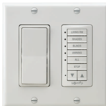
(shown with standard printed channel buttons)

Installation is quick and simple, no wiring is required. Included with each switch is an extended life lithium battery eliminating the need for an electrician. The DecoFlex WireFree™ RTS may be installed independently or next to an existing light switch (as shown) using the included wall mounting bracket and the appropriate wall plate.