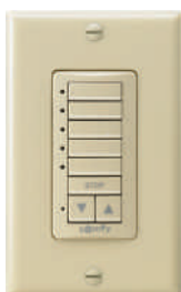
Part #1810814 (IVORY)