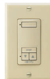
Part #1810898 (IVORY)