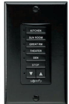
5 Channel Button DecoFlex WireFree™ RTS (BLACK)