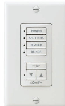
4 Channel Button DecoFlex WireFree™ RTS (WHITE)