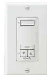
Part #1810897 (WHITE)