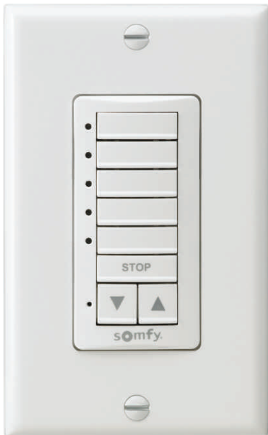
ACTUAL SIZE Part #1810813 (WHITE)