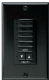
Part #1810830 (BLACK)