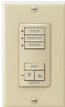
3 Channel Button DecoFlex WireFree™ RTS (IVORY)