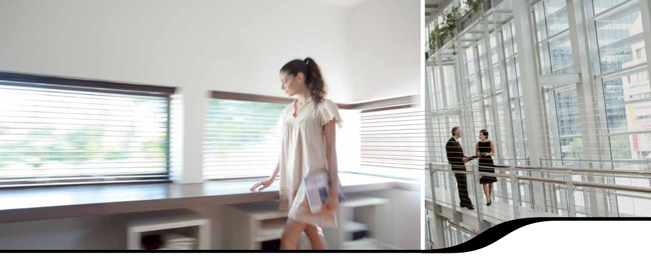
\mbox{Sonesse}^{\mbox{\scriptsize le B}} – The range of quiet motors