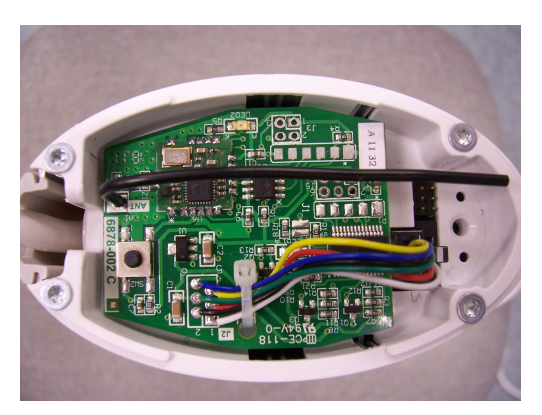
Figure 2. ZGM Installed