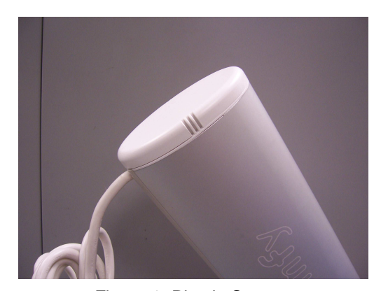
Figure 1. Plastic Cover

The Z-Wave Glydea Module (ZGM) is designed to be mounted in the bottom cavity of the Glydea drapery motor. To install the ZGM, ensure that the power cord is disconnected from the AC outlet and remove the plastic cover on the bottom of the motor (see Figure 1). Remove the protective tape covering the Velcro on the bottom of the ZGM, and install as shown in Figure 2. Insert the 6-pin modular connector into the modular jack to complete the installation. Do not install the plastic cover at this time.